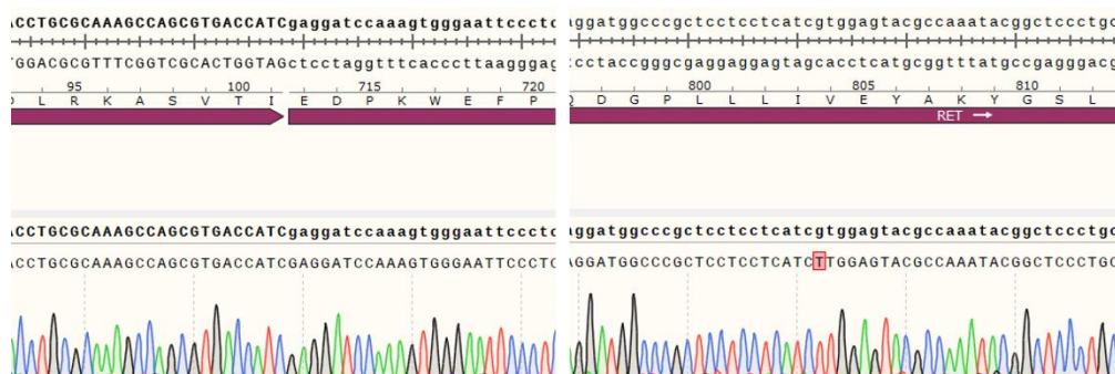
Figure 2 | The CCDC6-RET mutation analysis by Sanger sequencing.